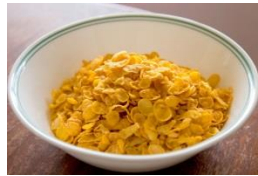
corn flakes and cereals