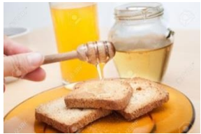
milk, toast and honey