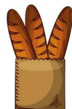
French bread /baguette