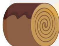
Swiss roll (UK) /jelly roll (US)