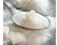
some sugar/a bit of sugar