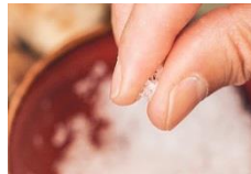
a pinch of salt