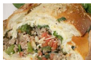
A stuffed bread