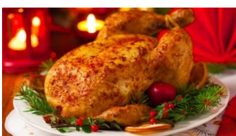
A stuffed chicken/turkey/fish