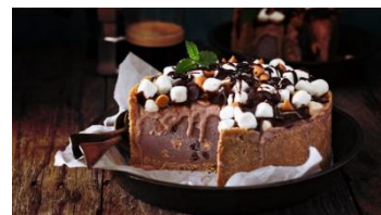
a filled cake/pie