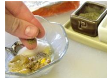
a pinch of black pepper